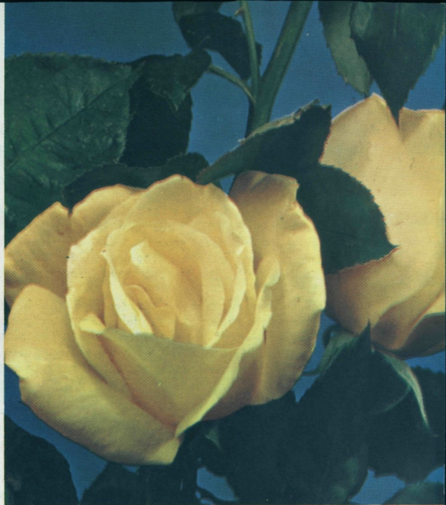
Beaute , A garden rose of definite charm. Its glowing brightness attracts from afar. F.C.C. Cert. of Merit. 6/-. Message , a grand new fragrant white rose of excellent quality. Good sturdy growth. The best of its type 7/6.